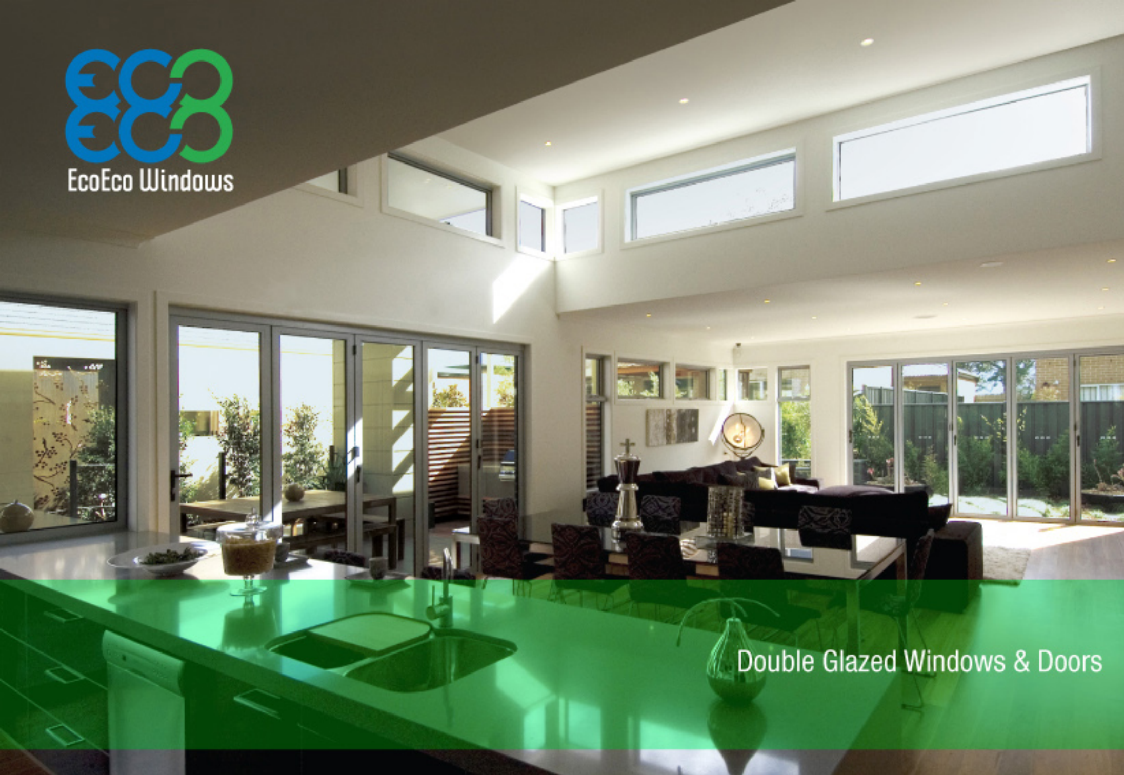
Double Glazed Windows & Doors